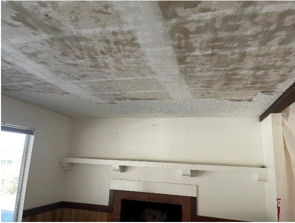
Popcorn scraped off the ceiling