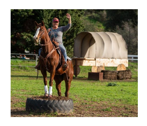
DATES: MAY 5th (Cinco de Mayo) June 2nd July 7th (4th of July)