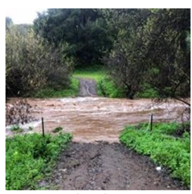
Later the 14th