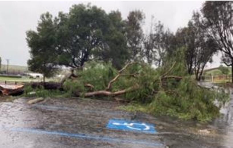
Our Pepper tree didn't survive the wind and rain.